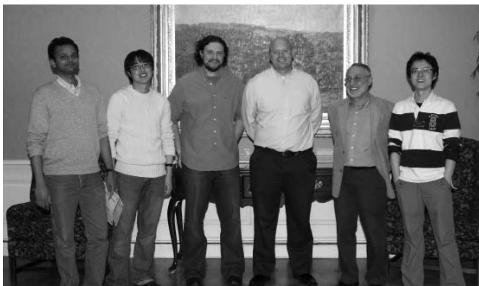
2009 Undergraduate award winners (top) and graduate student award winners (bottom).